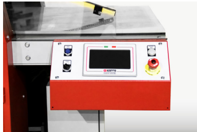
Touch panel 7"